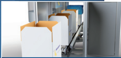
Product carrier input