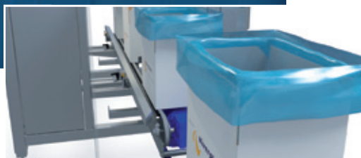
Bag in box