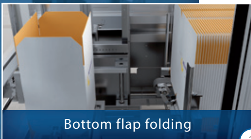
Bottom flap folding